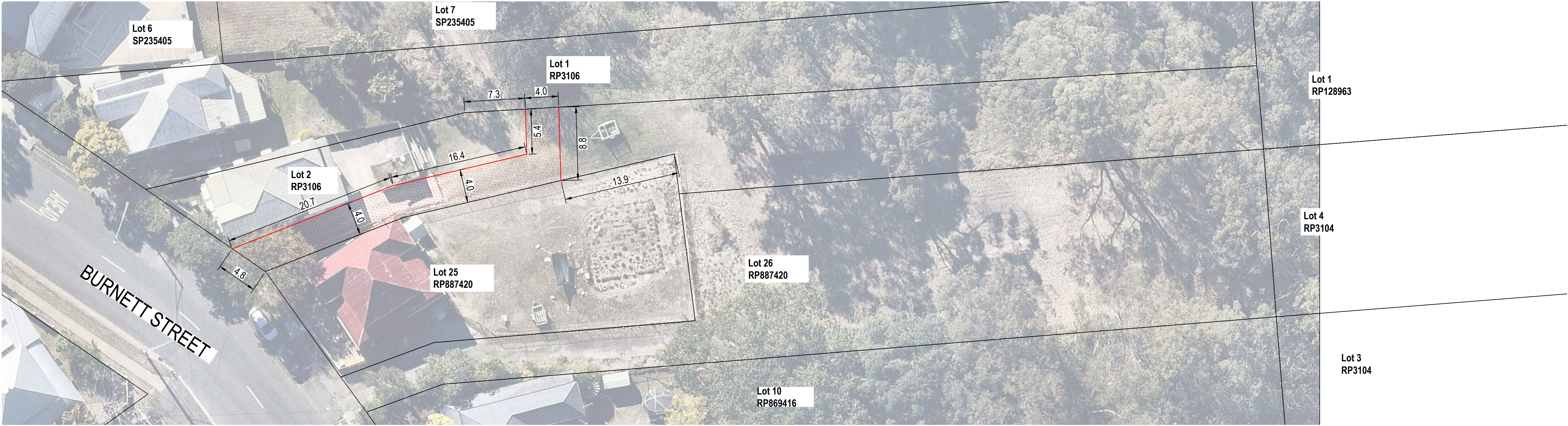
DETAIL PLAN Scale B

EXISTING AREA : 1351 m 2 EASEMENT AREA : 177 m 2