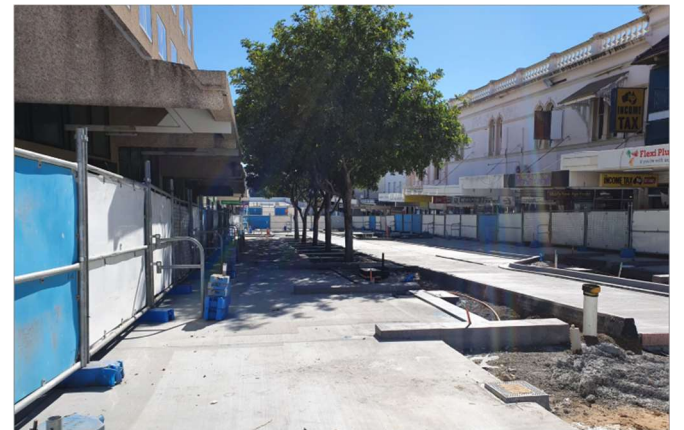
Nicholas St Central: Inground Services / Landscaping Works