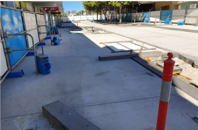
Nicholas St Southern: Inground Services / Landscaping Works