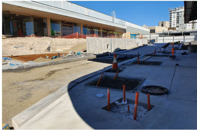
Union Pl: Inground Services / Rd Works