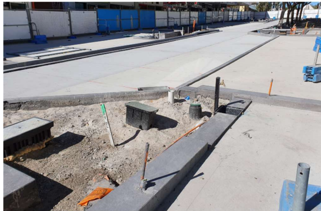
Nicholas St Southern: Inground Services / Landscaping Works