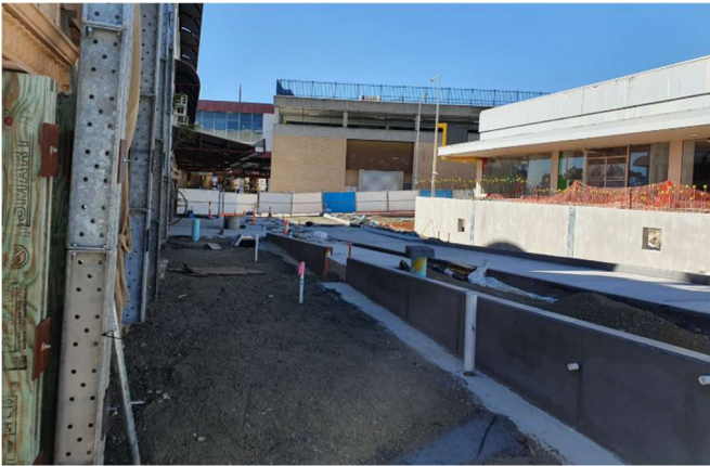
Union Pl: Inground Services / Footpath Works