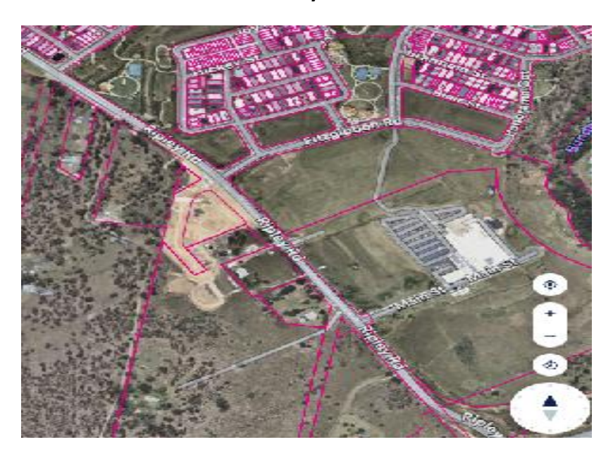
Plan Extract From 23/2013/PDAEE