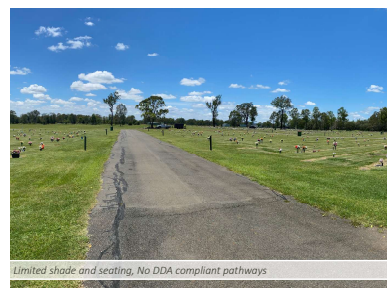
Limited shade and seating, No DDA compliant pathways