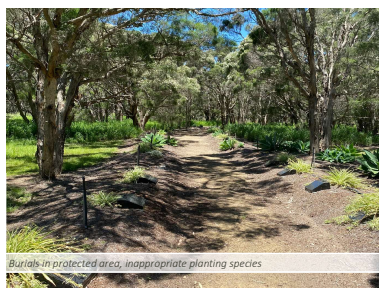
Burials in protected area, inappropriate planting species