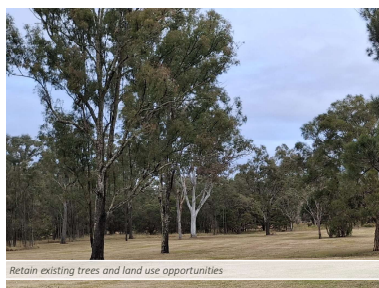
Retain existing trees and land use opportunities