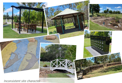
Inconsistent site character